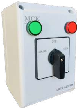
UKT5-633-SM with indication lights * OPTIONAL